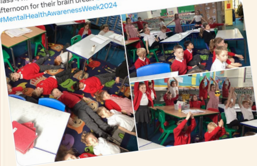
Class 4 have been enjoying some yoga and mindfulness activities this afternoon for their brain break @ChildrenFirstLP #MentalHealthAwarenessWeek2024