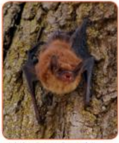
Photo course of press (Effects on ) and too before their more) (Williams) - grainst assign creates consume lastes - att duties

Bats go into hibernation from November or December until March or April. They often hibernate in empty buildings, old trees or caves. Bats might hibernate on their own or in small groups.