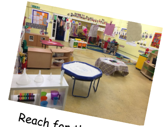
Reach for the Stars