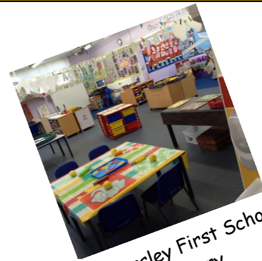
Knypersley First School Nursery